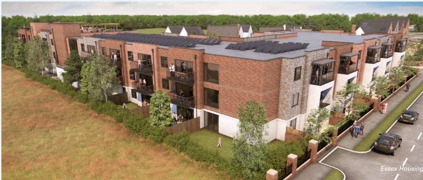
CGI of the Rocheway housing development