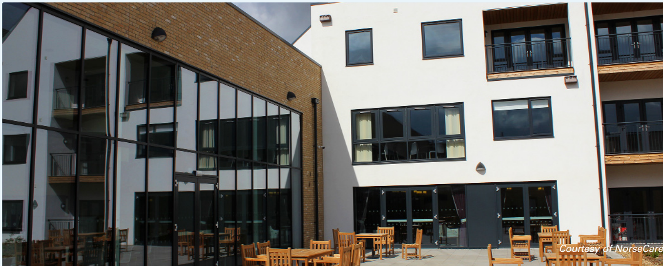
Part of Bowthorpe Care Village