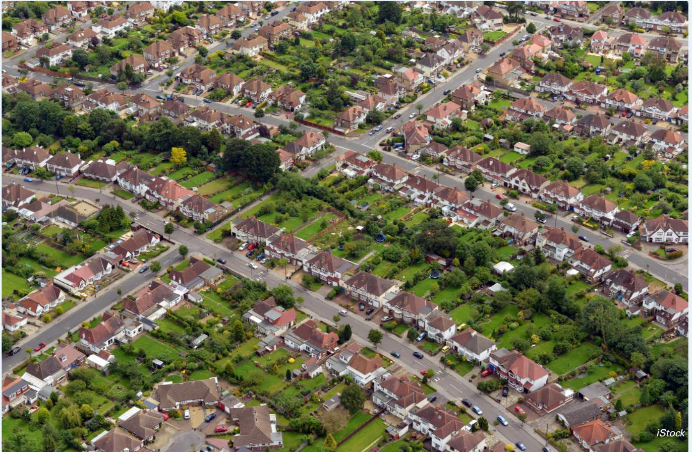
Housing in Surrey